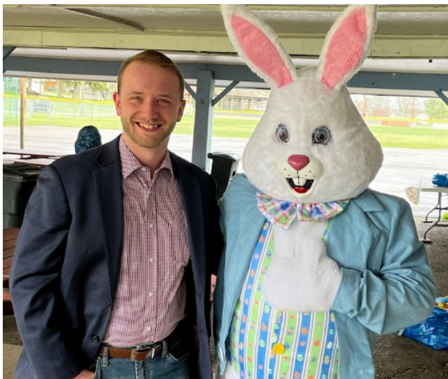
Easter Egg Hunt at the Park

There will be a large dumpster in town for public use, through May 5 th . It will be located at the new Village Garage (The green building by the water plant on Buena Vista)